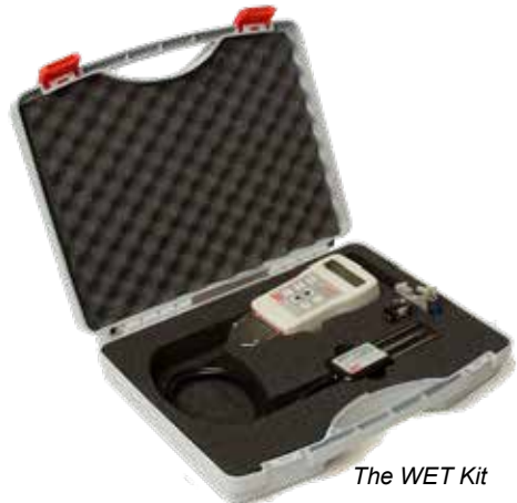
The WET Kit