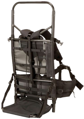
Pack frame with back straps