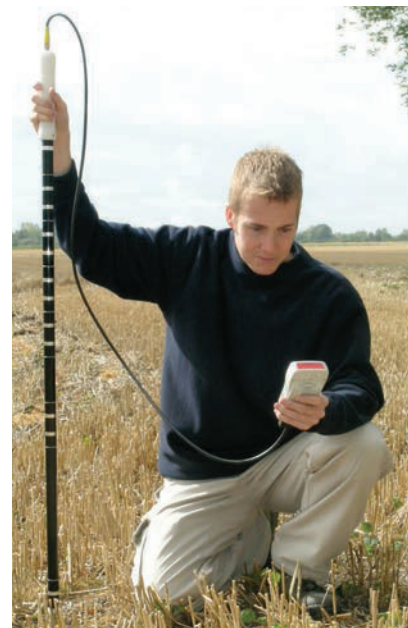
(Above) PR2/6 Profile Probe with HH2 Moisture Meter. (Right) PR2/4 Profile Probe