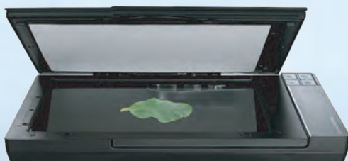
Entry Level System - Flatbed Scanner

Hardware: Users of Standard WinDIAS Systems supplied after March 2019 can upgrade to the Rapid System simply by ordering a Conveyor Belt Unit (subject to voltage type). Users of older WinDIAS systems wishing to update the lighting or add a Conveyor Belt Unit should contact Delta-T for guidance software.