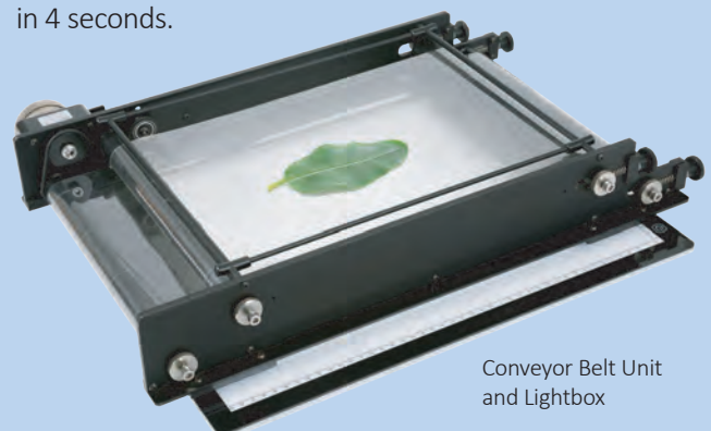
Conveyor Belt Unit and Lightbox

Long leaves: With the addition of the Conveyor Belt Unit, WinDIAS can measure leaves which are too long to fit in the field of view of the video camera. WinDIAS software repeatedly samples the leaf image as it moves past the camera at constant speed. Stored data sets include total area and the percentages of healthy and diseased leaf area. Typically, a leaf 30 cm long by 2 cm wide can be measured in 4 seconds.